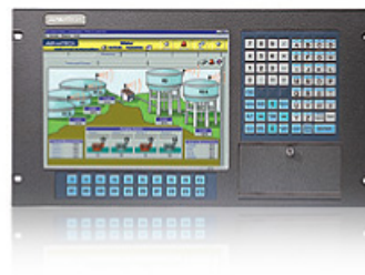
Compact Workstation with 12.1" LCD & 8 Expansion Slots