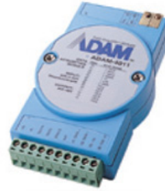
Thermocouple Input Module