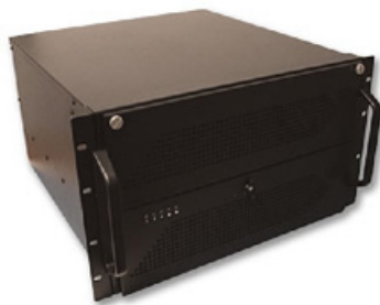
Ventrrix 6000 6U 20-slot Rackmount Chassis with Hot-swap Redundant Power Supply