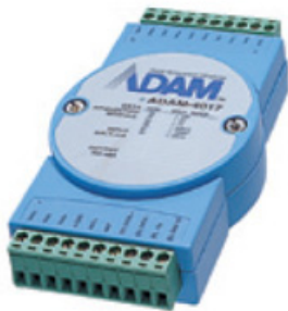
ADAM 4017 8-channel Analog Input Module