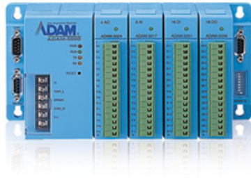
PC-based Programmable Controller with Modbus®