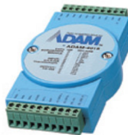
ADAM 4018 8-channel Thermocouple Input Module